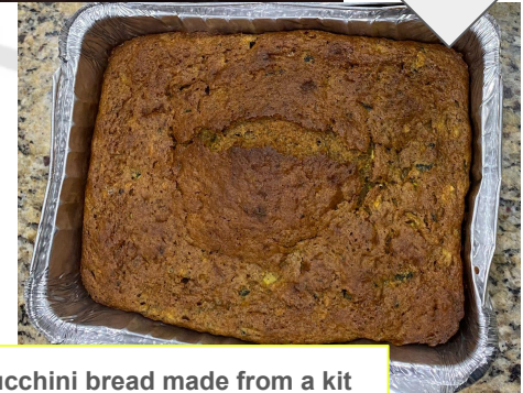
Zucchini bread made from a kit